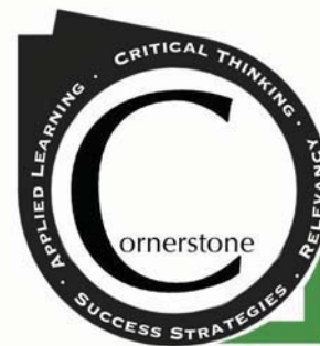
CONCEPT SUBMITTED BY JAMES SHEARS "C CIRCLE"