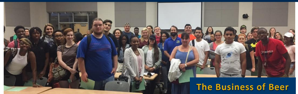
The Business of Beer