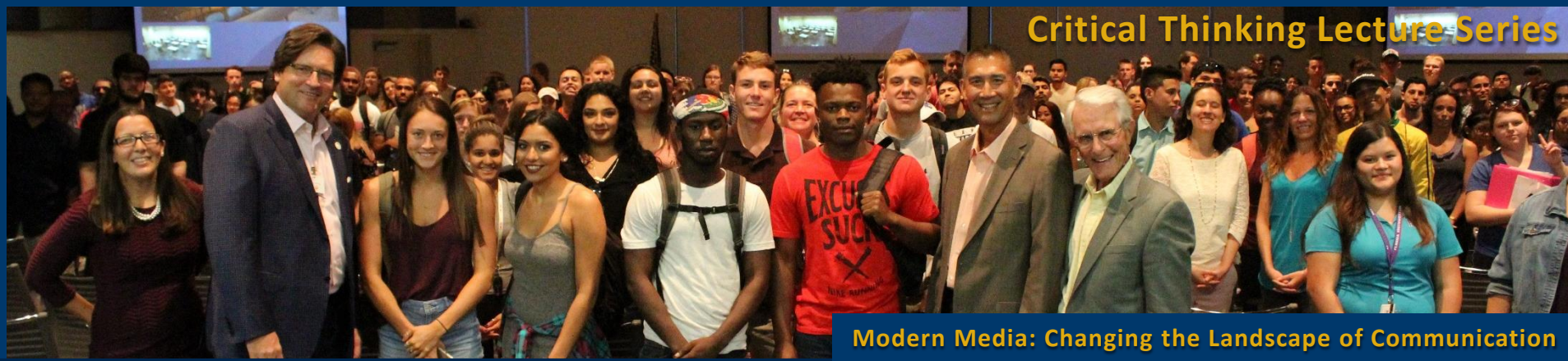
Modern Media: Changing the Landscape of Communication