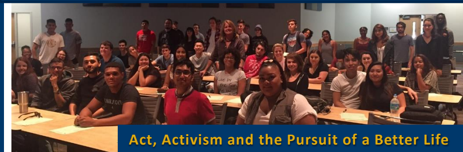
Act, Activism and the Pursuit of a Better Life

"I loved it all; the presenters talked about opened my eyes to how important reading and paying attention to the news truly is in order to stay informed and knowledgeable about various subjects and issues."