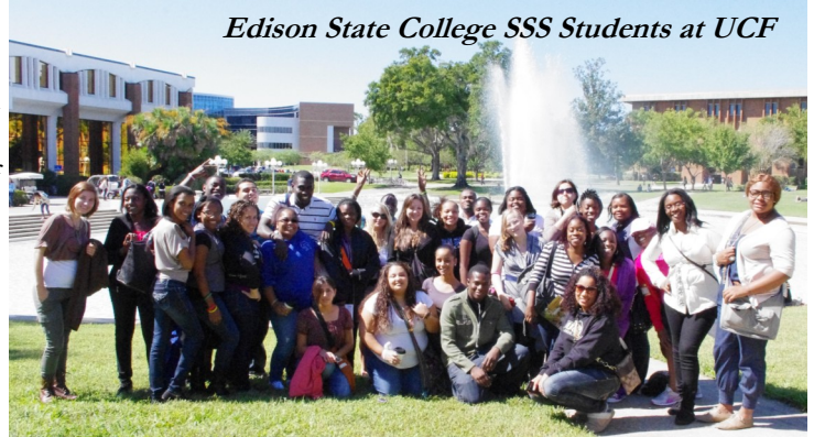
Edison State College SSS Students at UCF

In October of 2011, the Students Support Services (SSS) Program traveled to Orlando for an exploration trip to the University of Central Florida (UCF). Every semester the SSS Program takes students out to explore different colleges and universities in the state of Florida. In doing so, the SSS Students have an opportunity to learn about different colleges and also know whether a particular college is good for them.