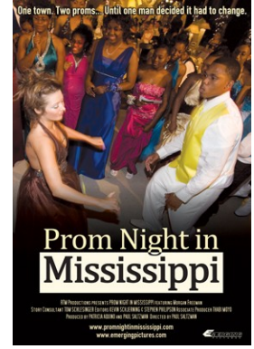
Creating a historic movement in a small town.