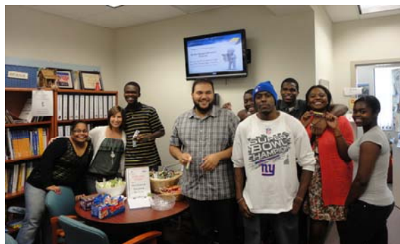
Some SSS Participants getting energized before the Spring 2012 finals