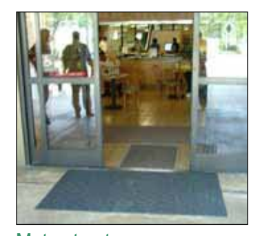
Mats at entrance way.

Typically, we do not pay attention to these contributing factors or we think they will not affect us or cause us to slip, so we