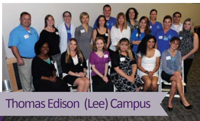
Thomas Edison (Lee) Campus