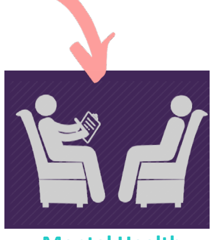
Mental Health Counseling