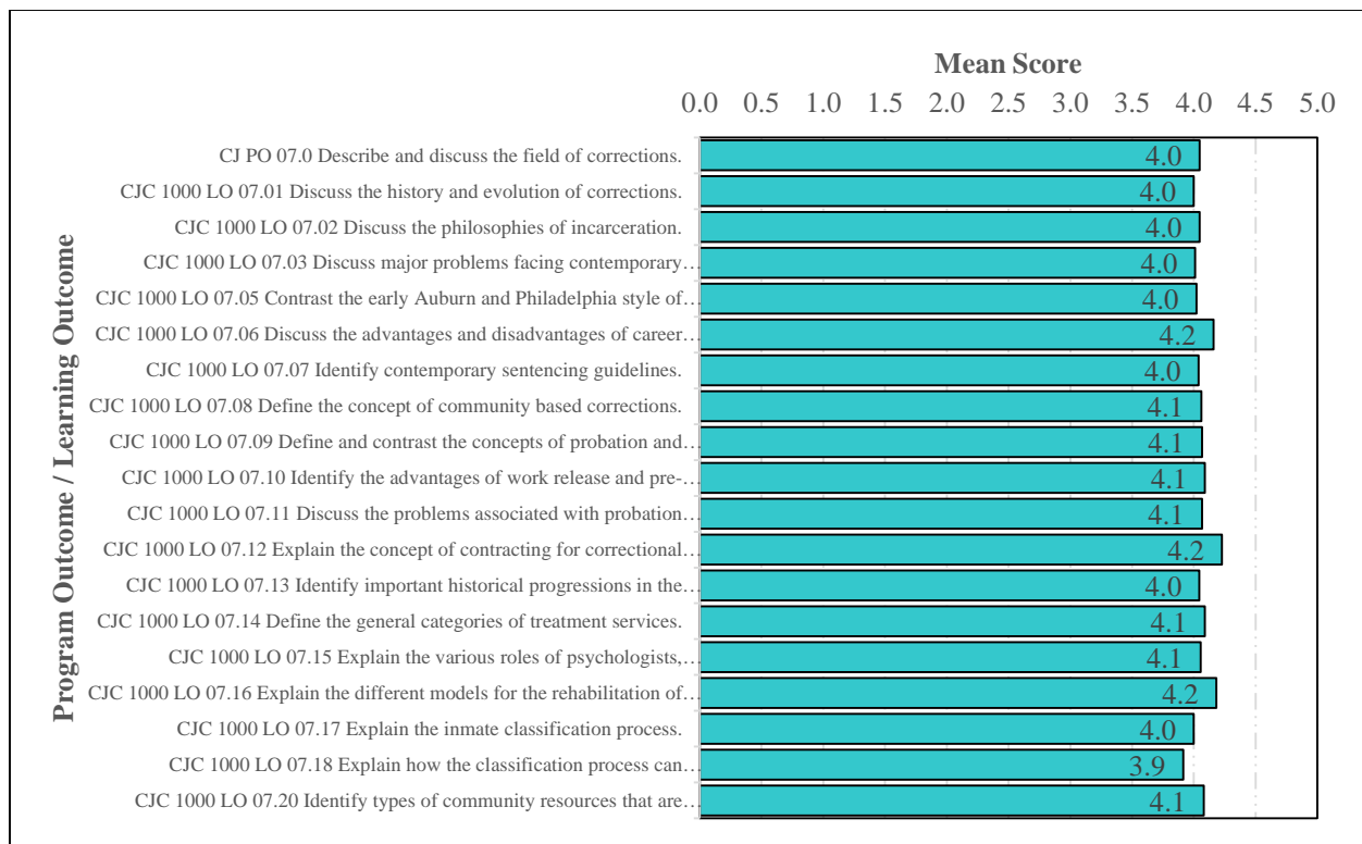
Figure 1. Bar graph of mean score by Outcome for CJC 1000.