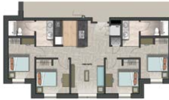
4 Bedroom Floor Plan