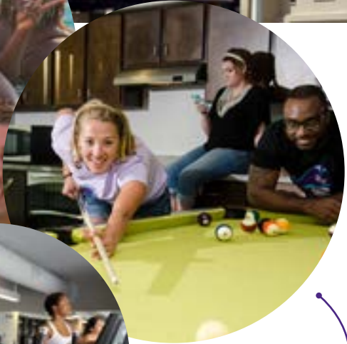
Fantastic amenities including study rooms, fitness center, and rec room.