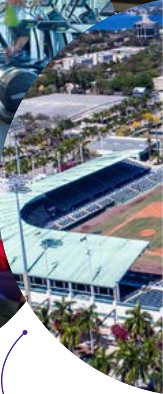
City of Palms Park