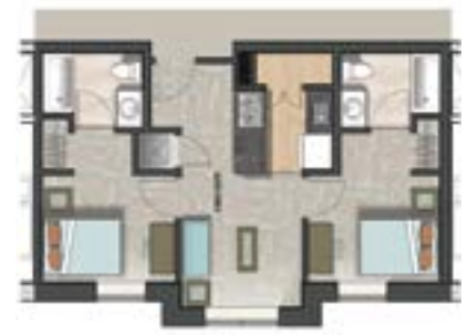
2 Bedroom Floor Plan