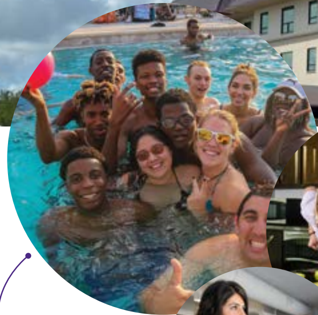
Hang out with friends at the pool on warm, sunny days!