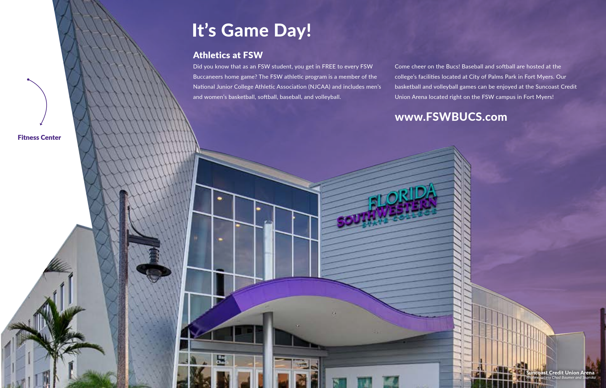
Suncoast Credit Union Arena