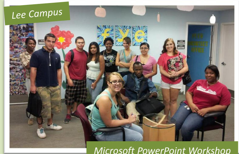
Microsoft PowerPoint Workshop