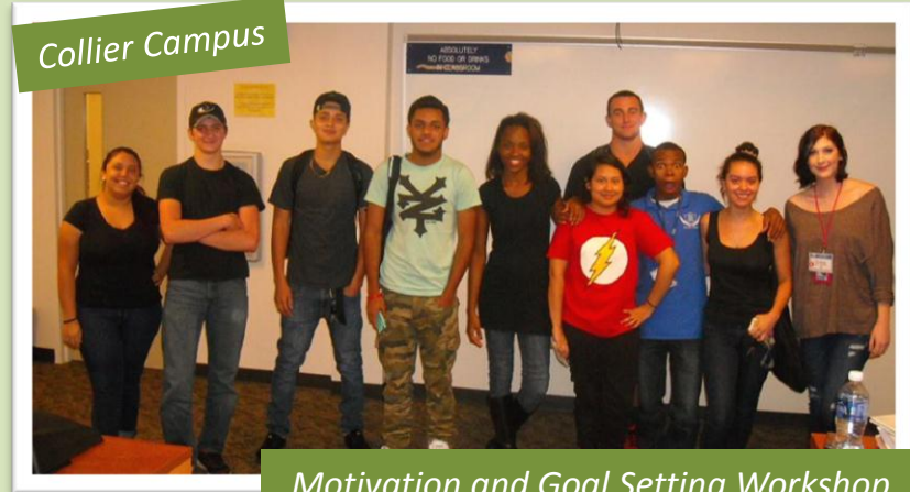
Motivation and Goal Setting Workshop