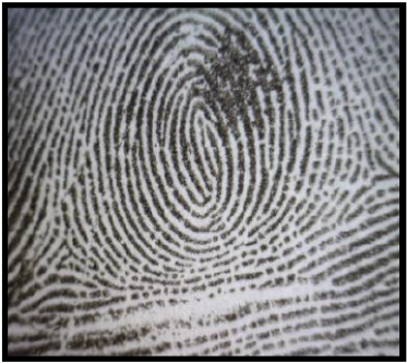
Bridget Sullivan, maid

Fingerprints were taken from all possible suspects. They are shown below: